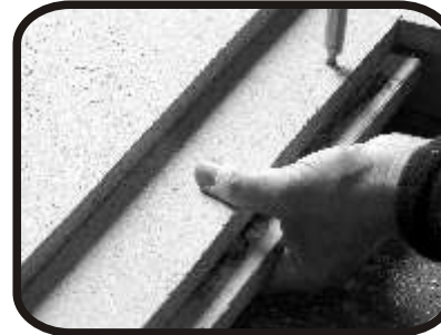
Repair by supporting the boards on each side

How often have you finished a job only to find you have nothing to support the replaced section of flooring?