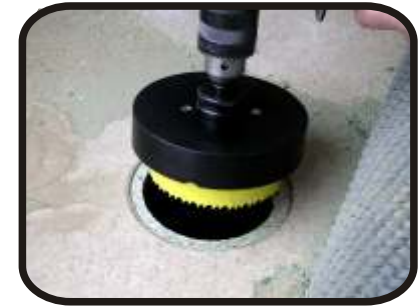
Cut the hole with the Cavity Master in seconds

The Cavity Master is ideal for gaining access to various services in seconds.