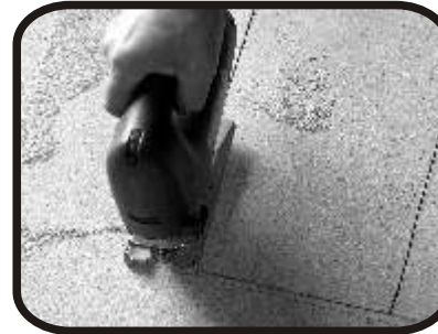
Cut a large hole with a jigsaw to gain access

Are you still cutting up flooring to access key services before repairing the hole in a time consuming manner?