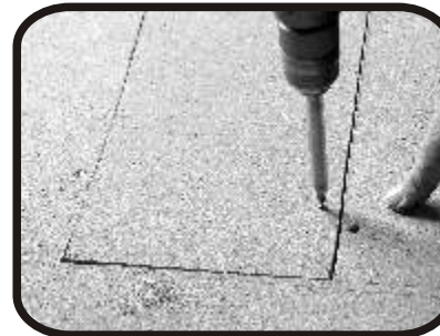
Finally screw down the replaced section securely

There is a better way, a cleaner way and importantly a cost effective way.