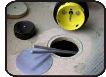
Cables or pipes are accessible via the hole

The introduction of plastic pipe in conjunction with the Cavity Master makes plumbing installations quicker and therefore more profitable.