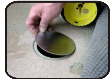
The hole is sealed with the cavity cover plate

Even plastered walls are easily negotiated. The Cavity Master access hole can be created and then covered with the specially designed wire plaster plate. Final plastering make the job quick, clean and simple.